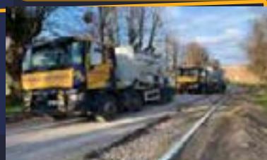
Concrete & Sweeper Hire