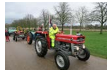
The same 135 on the 2020 Tractor Run