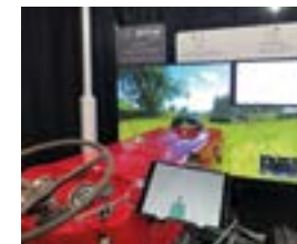
Agricision's GPS Simulator at Agritechnica Hannover 2019

Based in The Royal Borough we are delighted to support The REBAA.