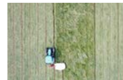
No more triangles when using onTrak for mowing

By using the operator's Apple or Android phone or tablet, wirelessly connected to the bonnet mounted receiver and light bar combination, onTrak delivers the guidance in a clear way that is unmatched by any other manual guidance system.